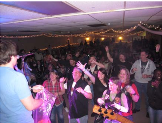
Mid-Winter Membership Drive and Party, Cottage Grove, MN

sored by Fury Motorcycles. Saturday, April 30th from noon-5pm at Fury Motorcycles on Concord St in South St Paul, MN