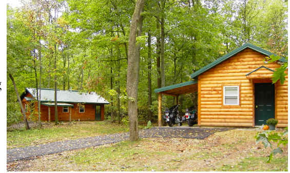
Blue Highway Motorcycle Lodge, Hillsboro, WI

The only traffic we experienced was leaving on Sunday morning as church was just letting out. The